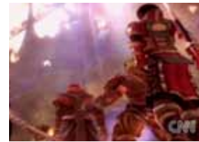
Internet gaming addiction leads to baby's death. Click on the picture to watch video.

Since Internet addiction has not formally been accepted as a disorder yet, we will use problematic internet use or PIU as the term to designate Internet-related behaviors that cause significant psychosocial impairment. So, is Internet addiction