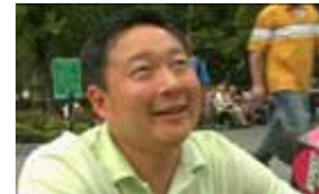
Click on the picture to view a New York Post report on Internet addiction.

The first diagnostic criteria for Internet addiction were proposed by Young (1996) – a modified version of the DSM-IV criteria for substance dependence – since there are similarities between the tolerance and withdrawal symptoms of Internet use and those of substance use. She also developed an Internet Addiction