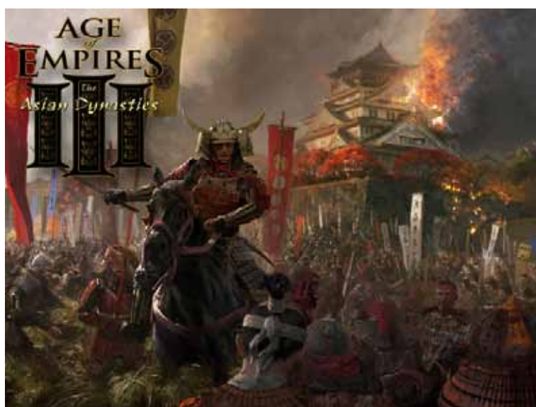
'Age of Empires III' computer game.