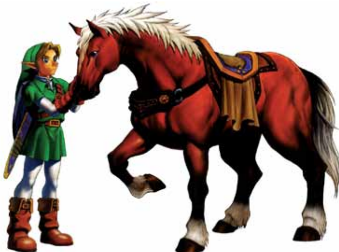
Legend of Zelda: Ocarina of Time, one of the most popular video games

Click on the picture to watch a news item about Internet addiction in China