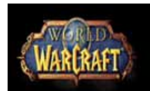
World of Warcraft Dangerous addiction or cultural phenomenon? Click on the picture to view.