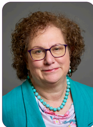
Hilary Cass, UK